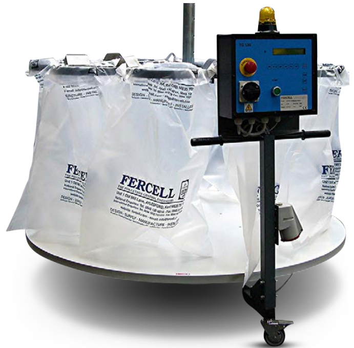
Image: F37 Series Rotating Bagging Carousel

The F37-Series is equipped with a TC130 microprocessor control. With a backlit LED touch screen providing clear input information, easy access and adjustment to the programmes, for automatically counting of briquettes from the associated briquette press. The default program auto-indexes to the consecutive station once the pre-programmed number of briquettes has been reached in the preceding station.