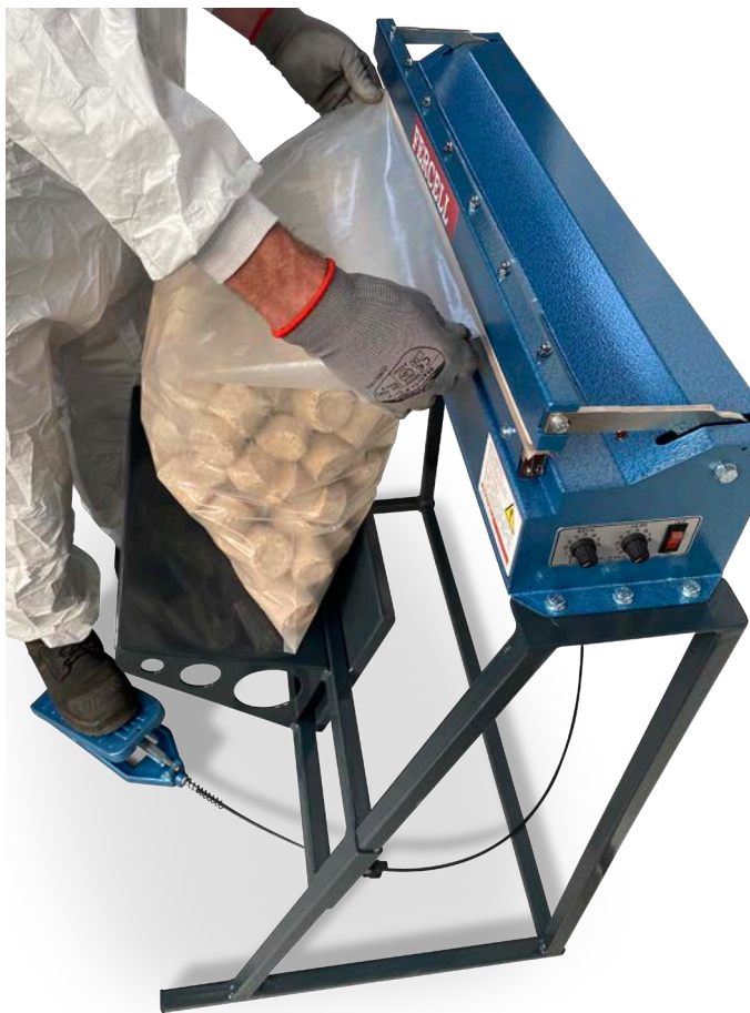
Image: HM-6500 Heat Sealer with Stand

The F37 Series rotating bagging carousel and HM-6500 make the perfect pair.